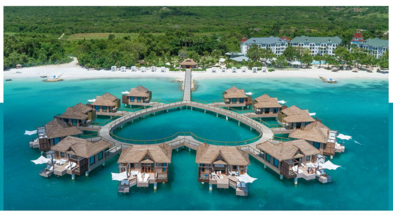
RESORT FACT SHEET